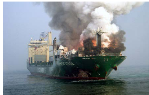
Fire on MV „Rickmers Genoa“ 2005 [1]