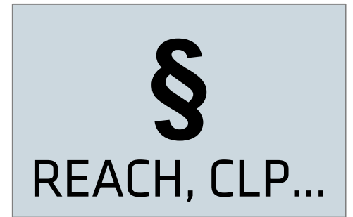
Changes in chemical legislation